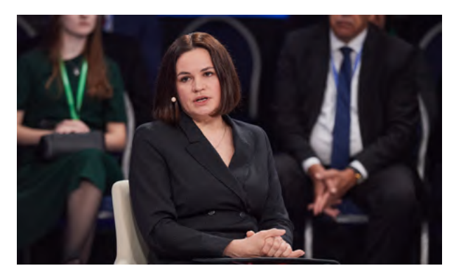
Sviatlana Tsikhanouskaya, Leader of the United Transitional Cabinet of Belarus: "We actively engage through media to change people's mindset about Russia and the situation in Ukraine."