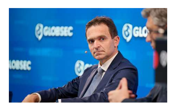
Ludovít Ódor, Prime Minister of the Slovak Republic: "Either conditionally freeze the prices of energy or put the burden on households because otherwise, we won't be able to do that transition."