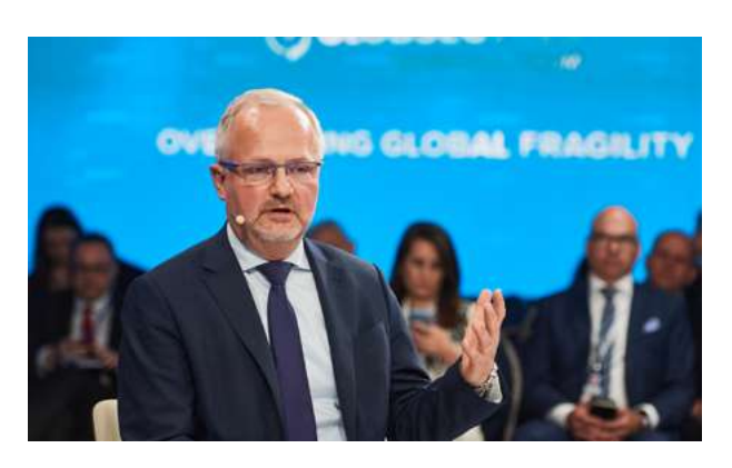
Peter Svec, Deputy Minister of Economy of the Slovak Republic: "The World Trade Organization is not working as we expected, and states are not showing signals of liberalization, which makes trade difficult."