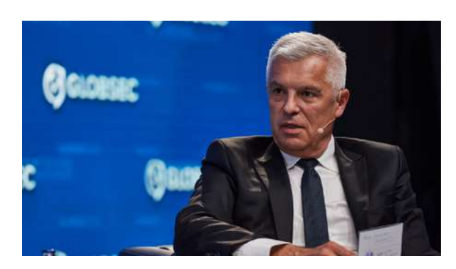
Ivan Korčok, former Minister of Foreign and European Affairs of the Slovak Republic: "Hungary is a problem. It is a problem not in tactical terms but in terms of political interpretation. There are many who refer to the Hungarian position as brave while other Central European countries like Poland, Slovakia, and the Czech Republic are referred to as American puppets."