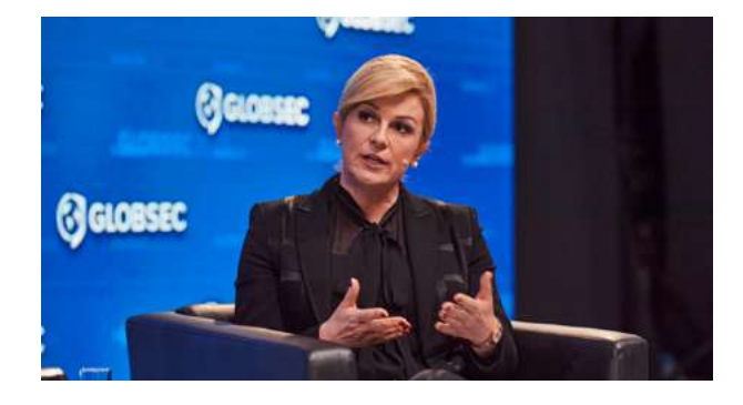
Kolinda Grabar-Kitarovic, Fourth President of the Republic of Croatia: "Sanctions do not work like bombs but more like acid. It is not an explosion but corrosion. They work long term in cooperation, in combination with other measures."