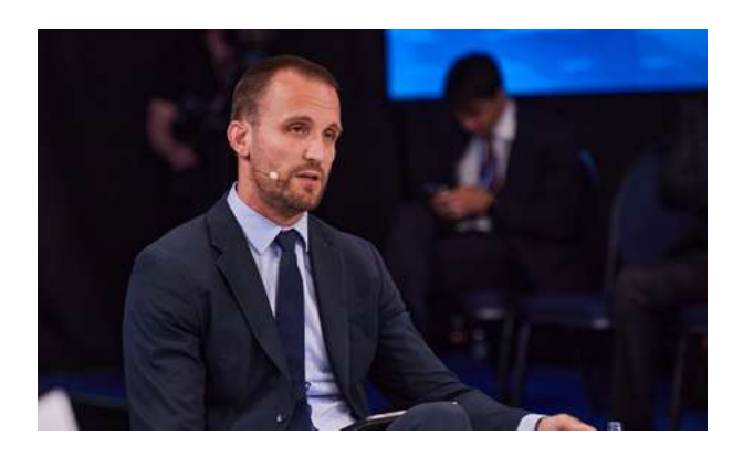
Šime Erlić, Minister of Regional Development and European Funds of the Republic of Croatia: "Cohesion policy gave us good support, and we believe it is good for young countries with fragile economies. Financial instruments play a key role in the development stage. It allowed mature institutions to mature even more. Therefore, the use of financial instruments is healthier."