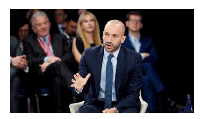
Benjamin Haddad, Member of Parliament, National Assembly of the French Republic: "There can be no peaceful and sovereign Europe without a sovereign Ukraine."