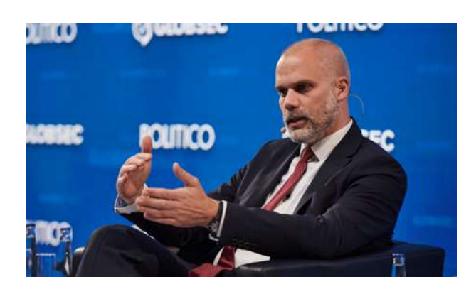
Martin Sklenár, Minister of Defence of the Slovak Republic: "For Slovakia, it has been a privilege because deterrence is working through NATO. Here we are under the deterrence umbrella while other countries, like Moldova or Ukraine, are not."