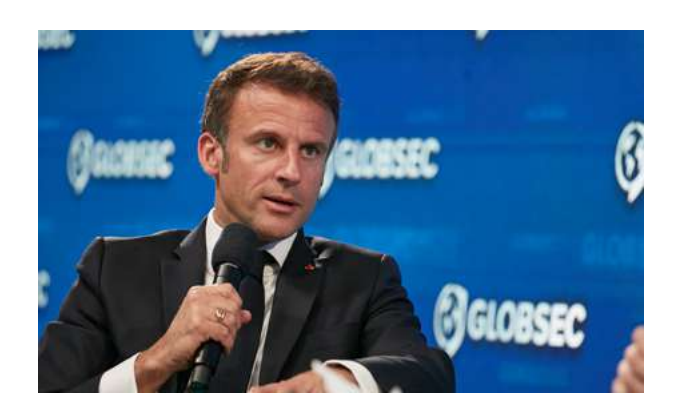
Emmanuel Macron, President of the French Republic: "We need to build something between security guarantees to Israel and full-fledged NATO membership for Ukraine. We need to provide strong and tangible security guarantees."