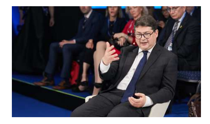
Pierre Heilbronn, Special Envoy of France for Ukraine's Relief and Reconstruction: "In fact, reconstruction is already happening in Ukraine. [...] From day one, France provided the support for Ukraine [both] on the military and the other side."