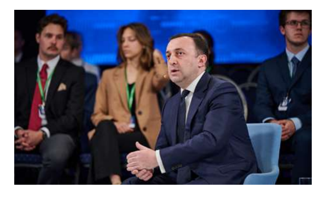
Irakli Garibashvili, Prime Minister of Georgia: "This is the most challenging time after the Second World War... We are doing everything according to Georgia's National Interest."