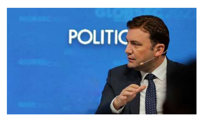
Bujar Osmani, Chairman-in-Office, OSCE and Minister of Foreign Affairs of the Republic of North Macedonia: "It's important that all sides [Albania, Kosovo, Serbia] continue to deescalate and keep the flow of the interactions.[...] You cannot leave a region of the heart of Europe unattended."

Milo Đukanovic, former President of Montenegro: "Russia developed its presence in the region in a very strategic way, through the media, security, and intelligence influence. However, people are not born with EU values, and it's easy for the people to get attracted to Russia."