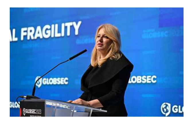
Zuzana Čaputová, President of the Slovak Republic: "We are far more resilient than we expected, and we are stronger than our opponents...To prevail, we need to stay the course, continue what we're doing and do it better."