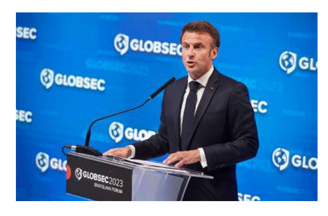
Emmanuel Macron, President of the French Republic: "Each country should have the right to pick its allies. If a country decides on transparency and democracy, it's not a threat to its neighbours...We will stand by the Ukrainian side, always."