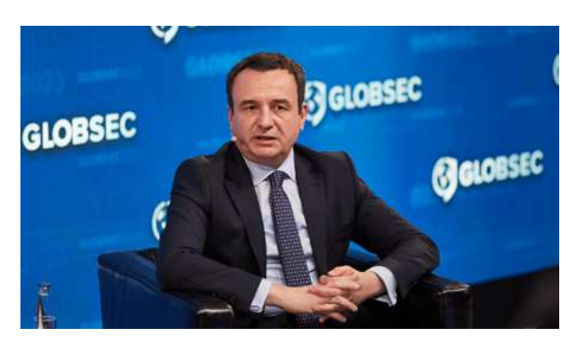
Albin Kurti, Prime Minister of the Republic of Kosovo: "We consider NATO indispensable for our security and defence"