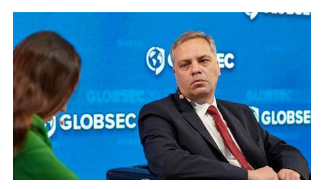
Vladimir Milov, Former Deputy Minister of Energy of the Russian Federation: "Patience is needed, and sanctions are progressing over time. Russia is entering a budget crisis that Putin did avoid last year."