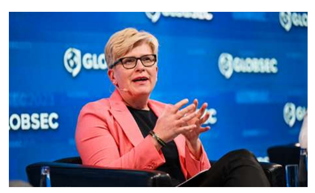
Ingrida Simonyte, Prime Minister of the Republic of Lithuania: "I hate to say this, as I am a big defender of the freedom of speech. But sometimes we mix freedom of speech with the freedom to spread lies."