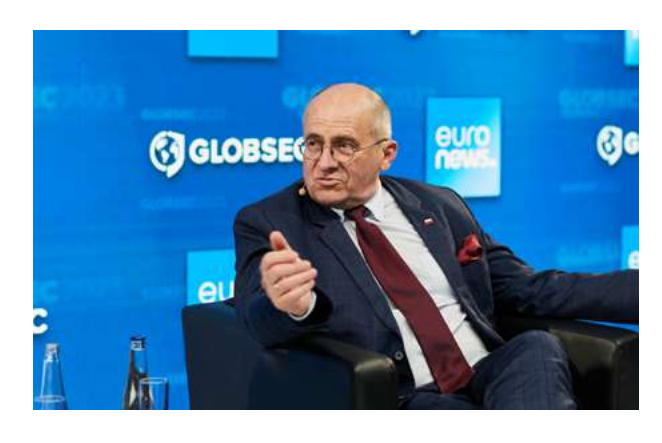
Zbigniew Rau, Minister of Foreign Affairs of the Republic of Poland: "Without unity, we cannot do anything... We believe that the future of Ukraine is both in the European Union and in NATO."