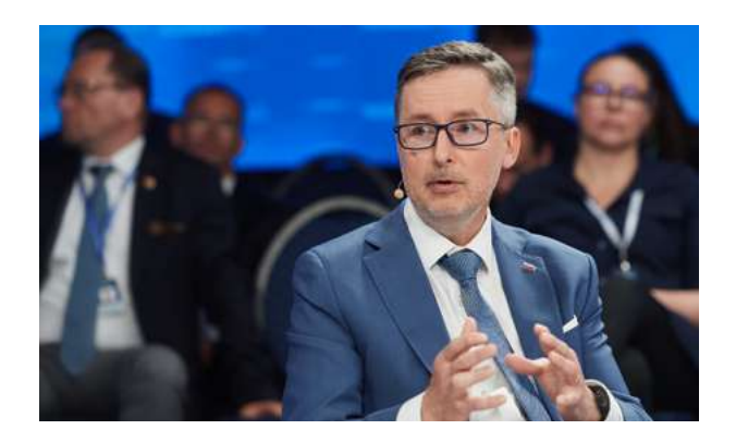
Peter Dovhun, Minister of Economy of the Slovak Republic: "It's not only about the finances available. It's also about the structure available for the new electricity investments."