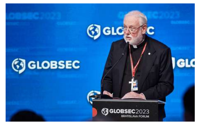
Paul Gallagher, Secretary for Relations with States of the Holy See: "Greater good cannot be achieved by one alone. We as human beings are all connected."