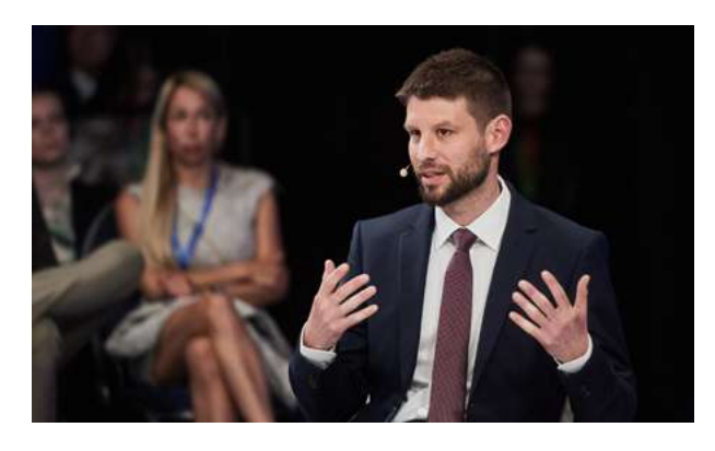
Michal Šimečka, Vice-President of the European Parliament: "People say we shouldn't have high expectations, but for Ukraine — the expectations are already there."