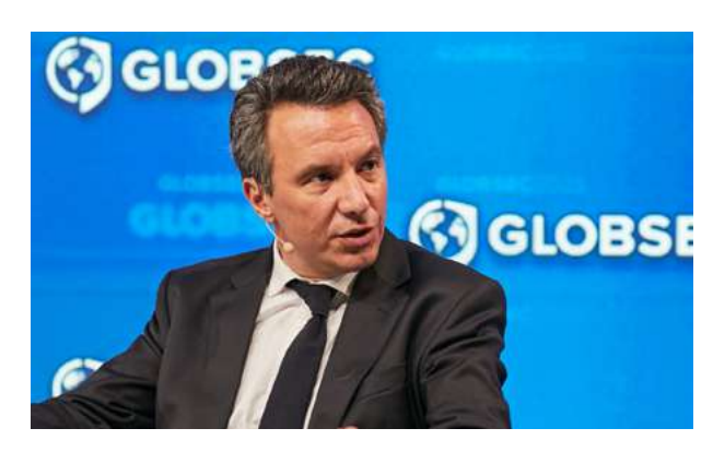
Camille Grand, Distinguished Fellow, European Council on Foreign Relations: "Between 2016 and 2022, NATO made an enormous effort to evolve, and it is the case when it comes to budget, level of investment, etc. We are in a much better position than we were five years ago. Now we need to be sustainable, continue to invest, and move around troops to make sure we are capable of acting in the right moment."