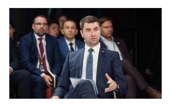
Davor Filipovic, Minister of Economy and Sustainable Development of the Republic of Croatia: "When it comes to European independence of energy supplies, we need to build infrastructure. By building the infrastructure, we are building security for the country and the European Union."