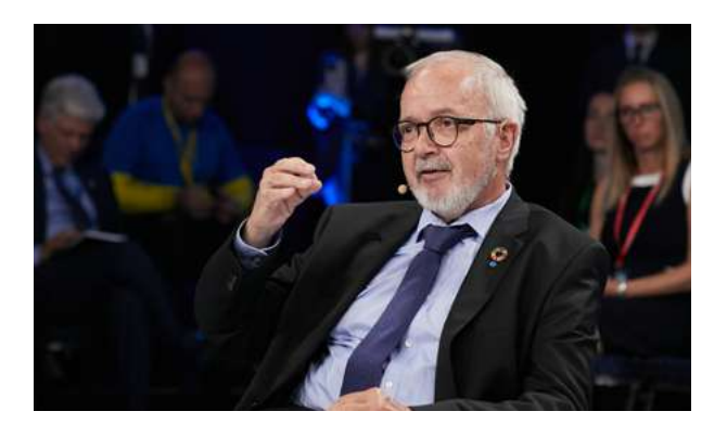
Werner Hoyer, President of the European Investment Bank: "Banking is not about running from the risk. [...] We have to consider the civilian side more and more."