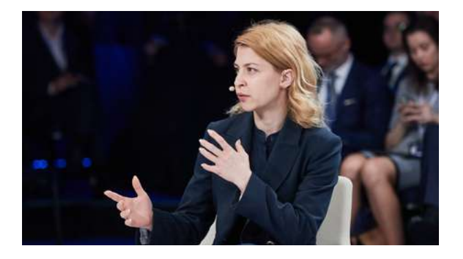
Olha Stefanishyna, Deputy Prime Minister for European and Euro-Atlantic Integration of Ukraine: "Any outcome of the war that is below the Ukrainian territorial integrity, restoration of sovereignty, and acceptance to NATO would play out in accordance with the Russian playbook."