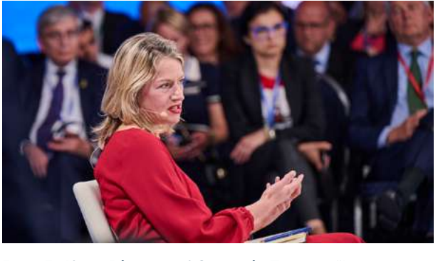
Rosa Balfour, Director of Carnegie Europe: "It is important for the West to engage with the Russian opposition because they are the building block of the Russian future."