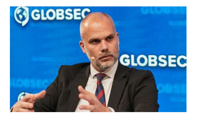
Martin Sklenár, Minister of Defence of the Slovak Republic: "NATO membership is Ukraine's decision, and we are here to support them along the way."