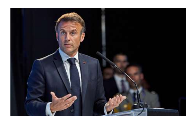
Emmanuel Macron, President of the French Republic: "We should be able to defend ourselves and our neighbours. We should be able to face wars today and in the future and help our neighbours if they need help today... This is the future; we cannot leave it up to others."